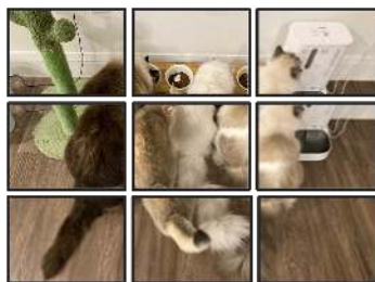
Input: 3 \times 3 \times 1